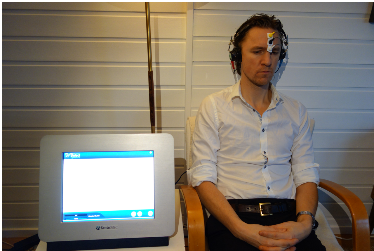
Figure 1. Demonstration of brainstem audiometry measurement equipment (first author pictured).

involves the patient sitting comfortably reclined in an armchair in a quiet and dimmed room with headphones, listening to an array of acoustic stimuli not exceeding 70 dB (Figure 1). The method registers evoked potentials resulting from neural activity in the brainstem. These potentials occur within 10 msec following acoustic stimulation, are registered by the surface electrodes, and stored digitally. The method is European Conformity (CE) marked.