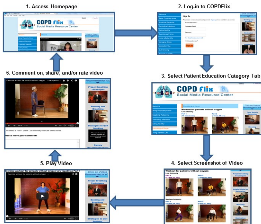
Figure 3. Screenshots of beta version of COPDFlix social media resource center, modified following usability evaluation.