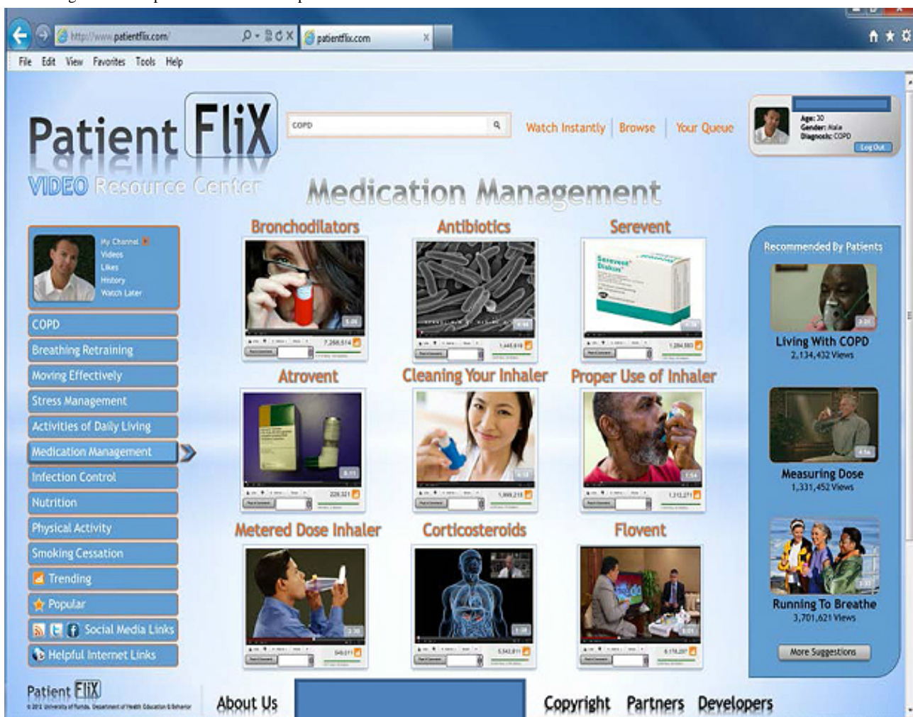
Figure 1. Original mock-up of the online COPD patient education social media website.

recommendations included (1) using an ordered format for topics, (2) listing categories clearly, (3) keeping pages short and concise, (4) using large buttons adequately spaced apart, and (5) maintaining design simplicity in drop-down menus and window placement. The simple design and shallow Web architecture of the social media website prototype benefitted from a contrasting color scheme, consistent sans serif fonts, minimal amount of written text, and one-touch point-and-click access to most site applications. All website functions and navigation tools were outlined using purposeful graphical representations and information displays that complied with our content strategy and visual design standards for medical information sites on the Internet [48-50]. Results from the patient and expert interviews helped the researchers create a functional social media website prototype.