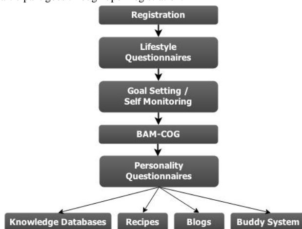
Figure 1. Flowchart of process a new participant goes through upon registration.

Considering the field setting for this intervention, it is difficult to control for concomitant care, or better yet if the BAM inspires participants to make use of other platforms to alter their health behavior in a positive way, this accomplishes the BAM’s goals. The BAM can and may function as a gateway to healthy behavior. Using the GSM and the yearly follow-up, the BAM can track changes over time even if participants actively use outside help that the BAM refers them to.