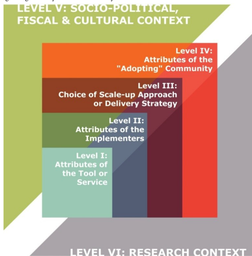
Figure 1. Framework for categorizing the study results—The Yamey Framework.

The Yamey Framework identifies a range of reported success factors, which are organized into 6 categories, representing different components of the scaling-up process. Inspired by the work of Bergh, van Rooyen, and Pattinson (2008) and Simmons and Shiffman (2007), these categories are the following: attributes of the specific tool or service being scaled-up, attributes of the implementers, chosen delivery strategy, attributes of the “adopting” community, the socio-political context, and the research context [9,10].