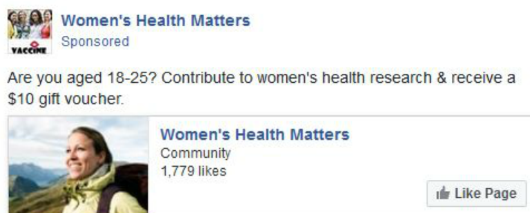
Figure 1. Example of an original advertisement from the VACCINE Study's Facebook advertising campaign.

Respondents could click through to the secure VACCINE Study website to read more about the study and register an expression of interest (EOI). Potential participants were contacted and screened by telephone to assess their eligibility and willingness to comply with the study requirements.