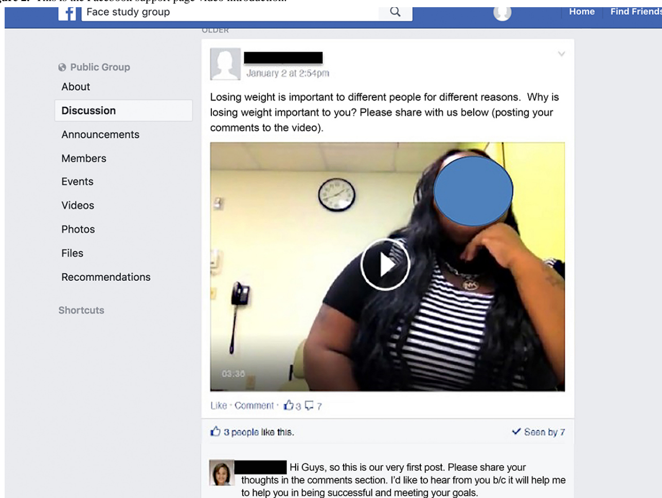
Figure 2. This is the Facebook support page video introduction.

Social media engagement was assessed by compiling the total number of “likes” plus comments [18]. “Likes” and comments were each also examined separately. Participants were incentivized to engage a minimum of 3 times per week in order to watch the 3 video postings. Participants were not considered to be engaged in social media if total engagement was less than or equal to 3 times per week. In exploratory analysis, the effect of social media engagement on BMI, BMI-z-score, depression, quality of life and perceived social support was examined.