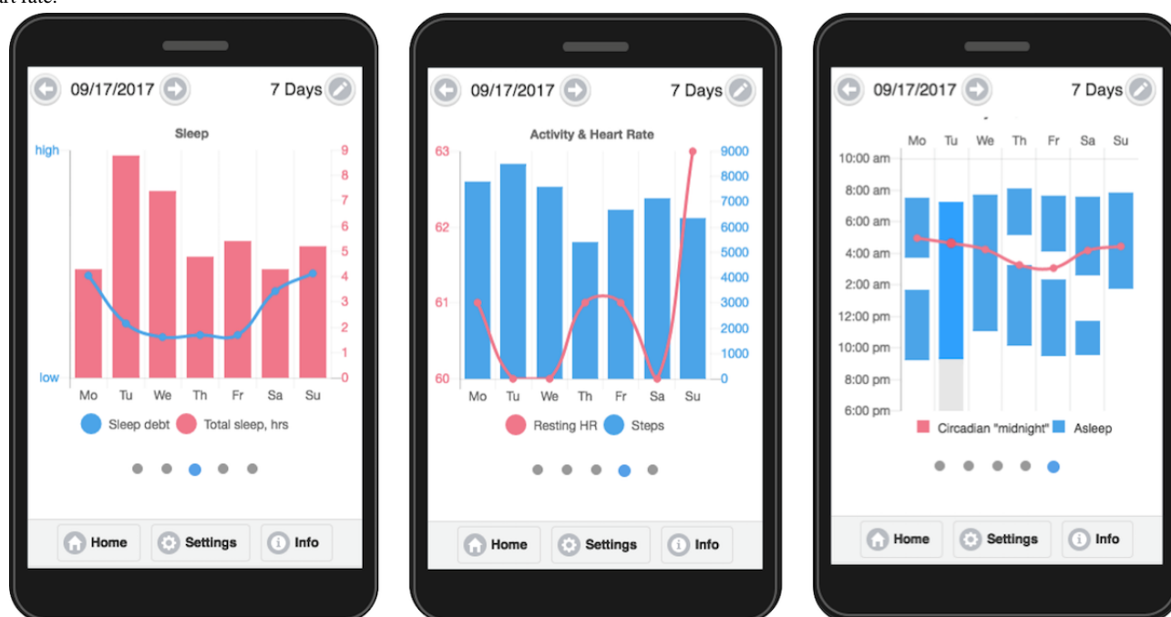
Figure 2. Screenshots of Visualize portion of study app showing data collected from Fitbit and variables computed from mathematical modeling. HR: heart rate.