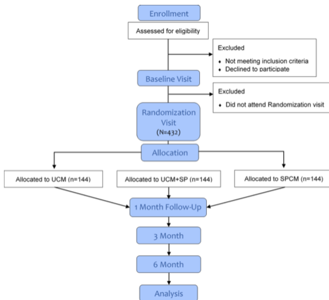
Figure 1. CONSORT flow diagram for Link2Care randomized controlled trial. UCM: usual case management; SP: smartphone; SPCM: smartphone-based case management.