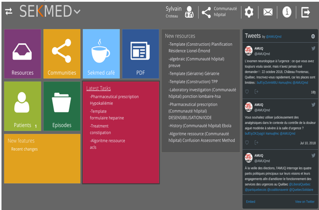
Figure 1. View of the platform dashboard.

The following is a brief description of every section: