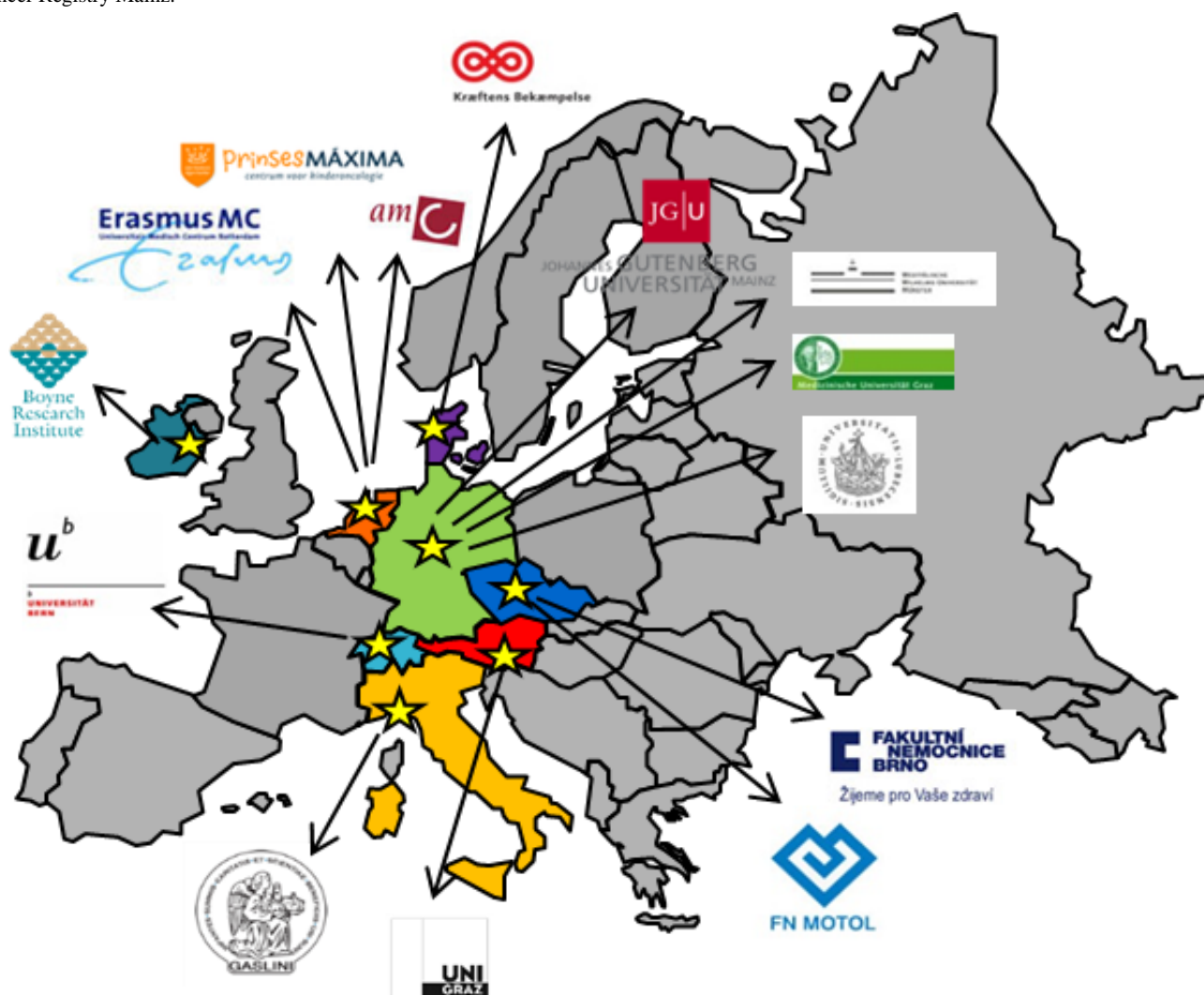
Figure 2. Data providers participating in WP4b and WP5 of PanCareLIFE: University of Bern, Instituto Giannina Gaslini, University Hospital Brno, Motol Teaching Hospital Prague, Kraeftens Bekaempelse, University Graz, Osteosarcoma clinical trial, University Hospital Muenster, Euramos clinical trial, University Lübeck, Academic Medical Center Amsterdam, Erasmus Medical Center Rotterdam, University Medical Center Groningen and Princess Máxima Center for Pediatric Oncology Utrecht. PanCareLIFE study management: Boyne Research Institute Drogheda and German Childhood Cancer Registry Mainz.