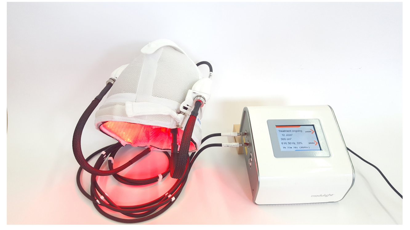
Figure 1. The light-emitting, fabric-based device involved in photodynamic therapy using the phosistos protocol: 635-nm red light is emitted at 1.3 mW/cm^2 by a fiber optic-based fabric that lines the inside of a cap.

All patients received oral and written information before signing informed consent forms and subsequently entering the study.