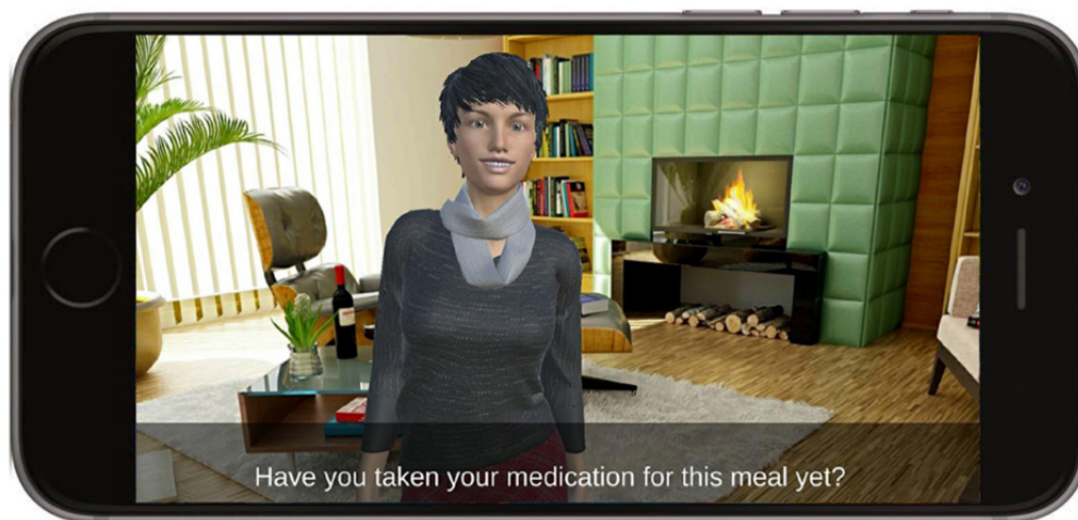
Figure 3. Example of daily check-up and monitoring by the iHeartHelper.