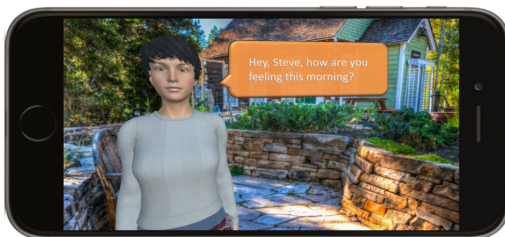
Figure 2. Example of the interface of iHeartHelper.

Audio files as well as other data can be periodically uploaded by a reporting module to a central data repository, which allows the health care provider to monitor the patient's progress as needed via a Web-based interface (Figure 5). The Web portal for health care providers has also been developed and linked with the iHeartHelper (Figure 6). The audio files and any information (eg, vital signs and weight) recorded by the patient can be accessed by the care team (eg, physician, physician assistant, nurse, and disease manager). Once the patient's data exceed the predefined thresholds with respect to the clinical guideline and physician's suggestions, the health care provider will be alerted. According to the severity of the situation, the health care provider can send a message to the patient through the portal to give him/her suggestions or schedule a phone call or visit. The message is delivered to the patient by the iHeartHelper. There are two-stage confirmations to ensure that the message is delivered to the patient.