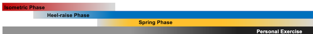
Figure 2. Progressive tendon-loading exercise program with 4 overlapping phases (isometric, heel raise, spring phase, and self-selected exercise). Participants are encouraged to maintain any ongoing personal exercise throughout the study, and then receive additional instruction on progression at final phase. Patient are instructed to monitor for symptom increase within 24-hour window after completion of exercises.

Eval #1 Visit #1 Visit #2 Visit #3 Visit #4 Visit #5 Visit #6 Visit #7 Eval #2 Eval #3