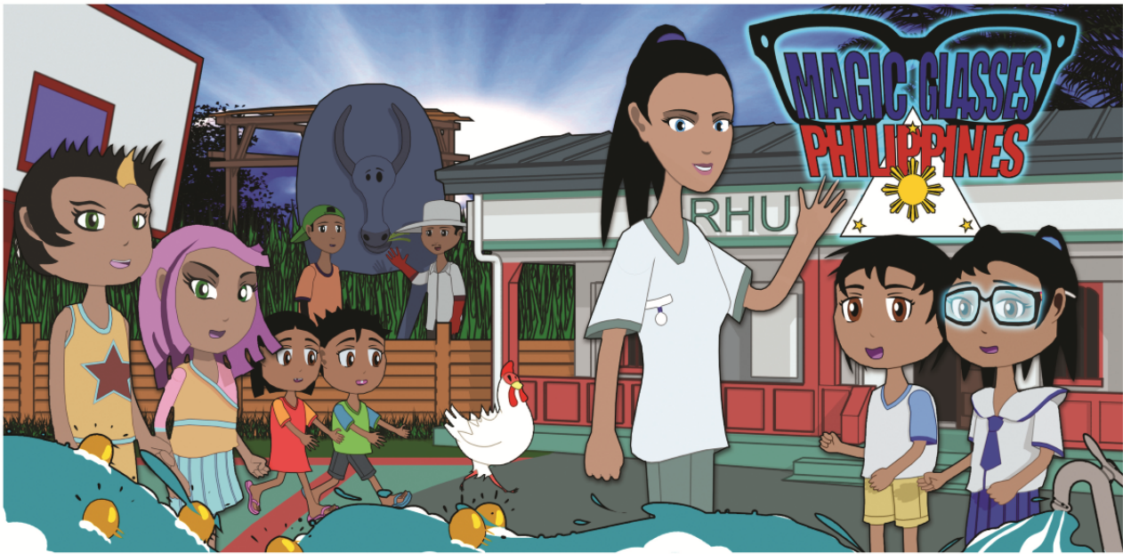
Figure 2. Cover of the cartoon “The Magic Glasses Philippines”.