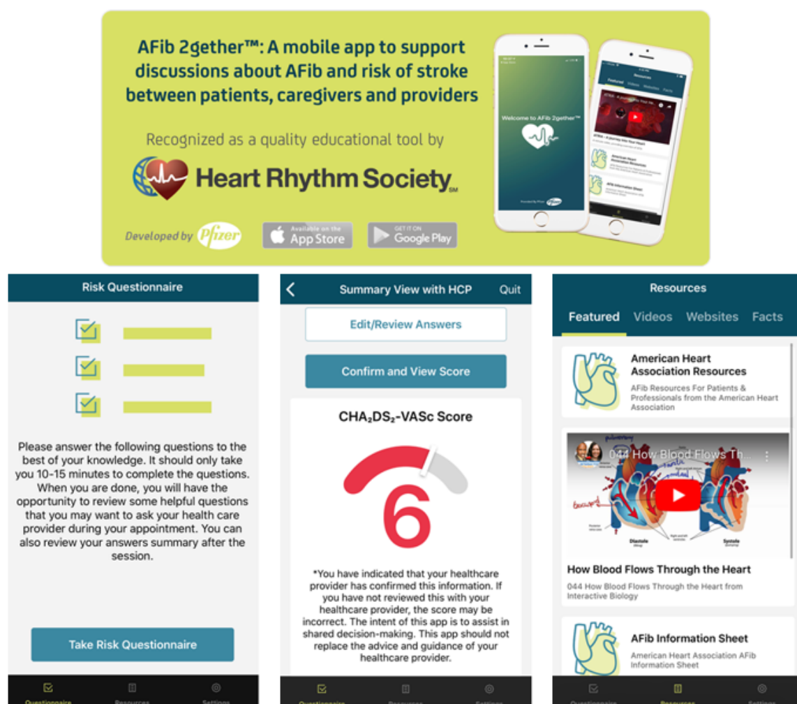
Figure 2. Advertisement of the AFib 2gether app in the Heart Rhythm Society's patient toolkit with screenshots of sections of the app.