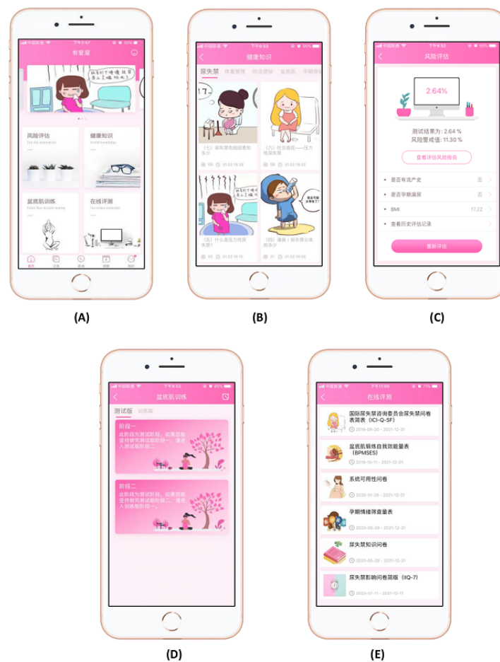
Figure 3. Screenshots of the UIW (Urinary Incontinence for Women) app, including the (A) Home Page, (B) Risk Assessment forum, (C) Health Education forum, (D) Pelvic Floor Muscle Training (PFMT) forum, and (E) Online Evaluation forum.

The Risk Assessment forum provides a risk prediction for SUI during the early stage of pregnancy based on a predictive tool previously developed by the research team [41]. According to the pregnant woman's clinical risk factors, it identifies the high-risk population and gives feedback to the users whether they are at a high or low risk level.