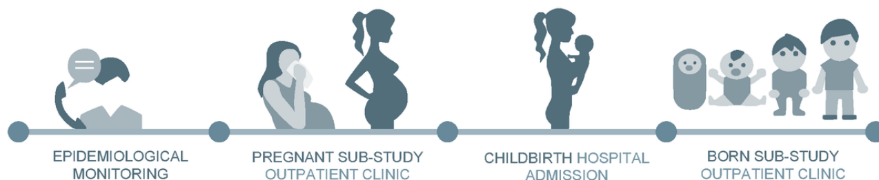
Figure 1. Pregnancy Outcomes and Child Development Effects of SARS-CoV-2 Infection Study follow-up flowchart.

The PREGNANT substudy will follow—until day 21 postpartum—pregnant women who are exposed to SARS-CoV-2 at any phase of gestation and compare them to a control group consisting of nonexposed pregnant women. The BORN substudy will follow the children of the women included in the preceding ( PREGNANT ) branch. These children will be allocated into two comparison groups (exposed and nonexposed) according to their mothers' in-pregnancy exposure status and will be followed up by a multidisciplinary team of health professionals