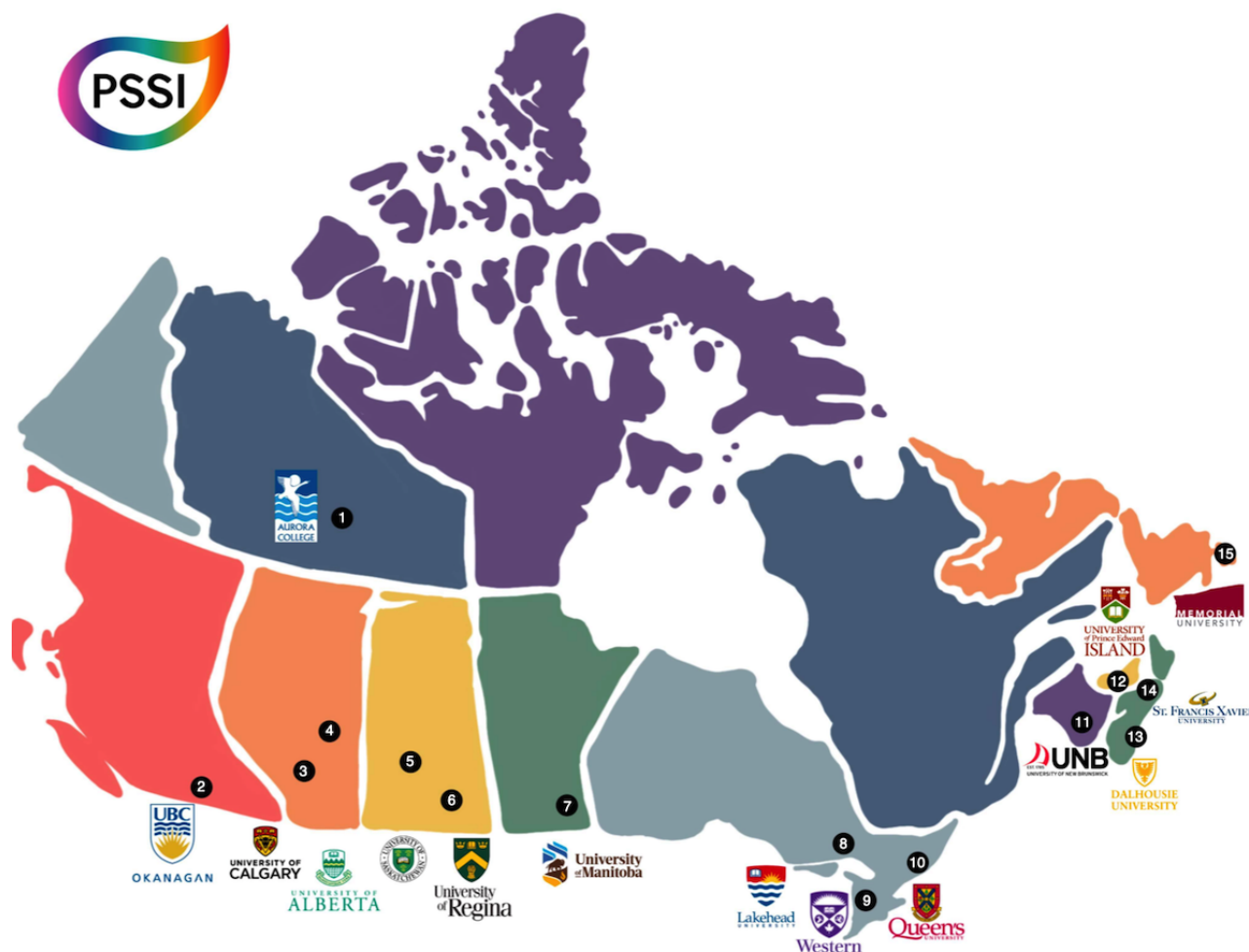
Figure 3. Participating institutions for project year 1 (2020-2021): (1) Aurora College (Northwest Territories); (2) University of British Columbia, Okanagan (British Columbia); (3) University of Calgary (Alberta); (4) University of Alberta (Alberta); (5) University of Saskatchewan (Saskatchewan); (6) University of Regina (Saskatchewan); (7) University of Manitoba (Manitoba); (8) Lakehead University (Ontario); (9) Western University (Ontario); (10) Queen’s University (Ontario); (11) University of New Brunswick (New Brunswick); (12) University of Prince Edward Island (Prince Edward Island); (13) Dalhousie University (Nova Scotia); (14) St. Francis Xavier University (Nova Scotia); and (15) Memorial University of Newfoundland (Newfoundland and Labrador). PSSI: Post-Secondary Student Stressors Index.

The goal of this research is to survey a wide variety of students enrolled at public postsecondary institutions across Canada. In 2020-2021, 15 universities were successfully recruited for the first year of the project, representing all but 1 province, in addition to 1 territory (Figure 3); this suggests that the institutional uptake of and response to the tool are positive. There are no inclusion or exclusion criteria for participation, aside from enrolment at a participating institution at the time of survey completion. Moving forward, additional institutions (including additional universities and colleges) will be added with each subsequent iteration of the survey.