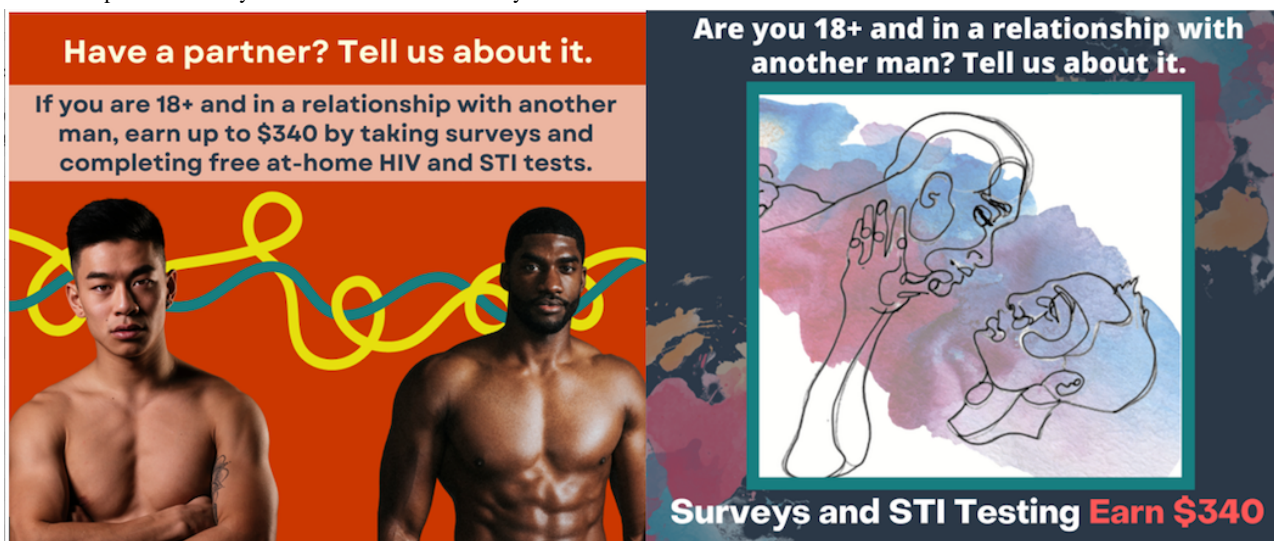
Figure 3. Sample cohort study advertisements. STI: sexually transmitted infection.