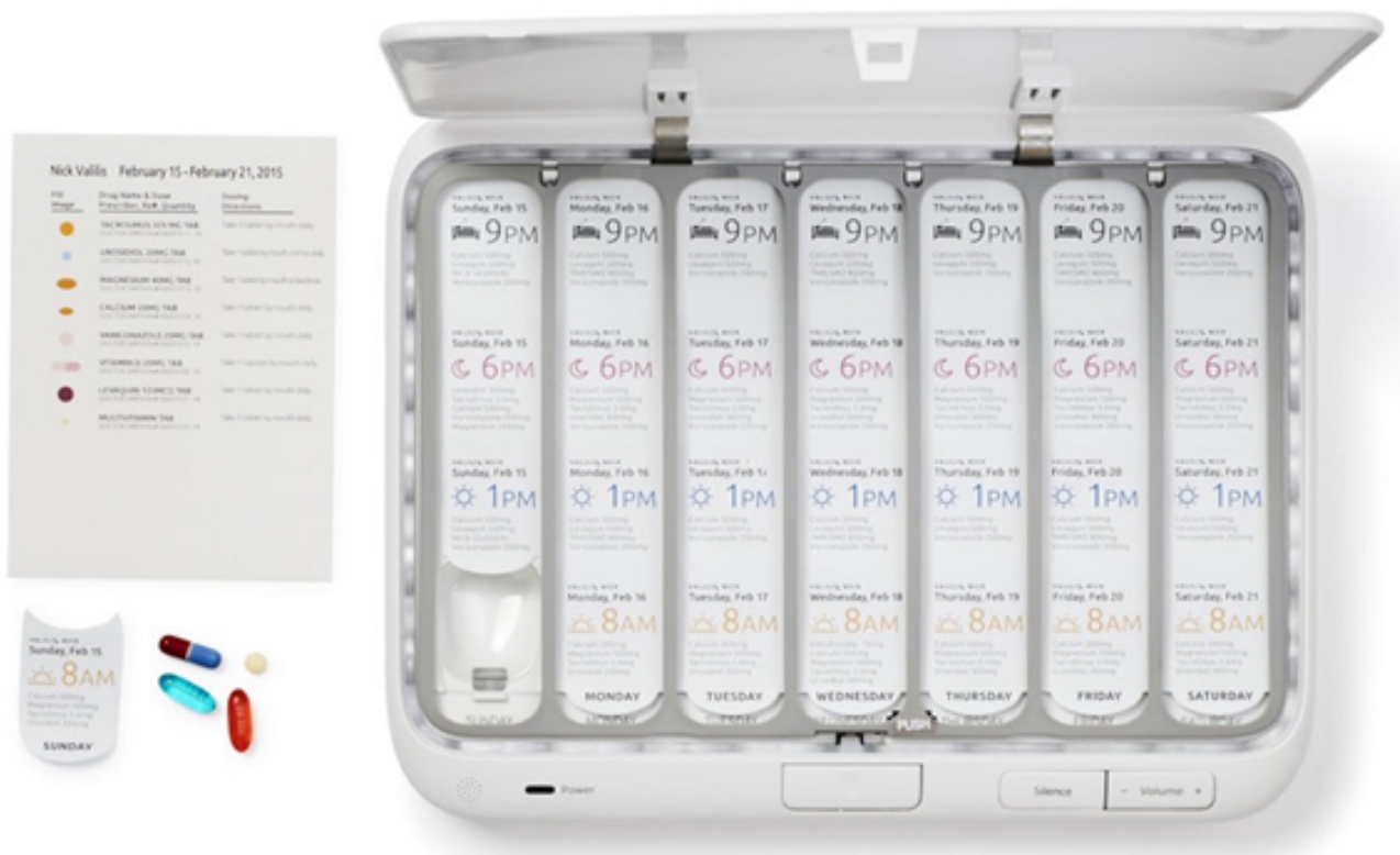
Figure 2. Electronic pillbox TowerView Health used for Project SMART.

As shown in Figure 2, the TowerView Health pillbox is 10×7.5×1.5 inches, which is comparable with a handheld device such as an iPad, and can be linked to a smartphone. It has the capacity to hold pills or tablets for a weekly medication regimen of up to 4 dosages a day. The pills are nestled in 28 individual wells, each with its own sensor, to indicate when a dosage has been removed. The box has a built-in alarm that emits both a low sound and a flash of light. The pillboxes have 4G cellular capability via an integrated chip and hence have the ability to communicate with other devices such as smartphones. This capability is useful for transmitting real-time adherence data to the secure TowerView Health server and communicating with linked smartphones via SMS text messages.