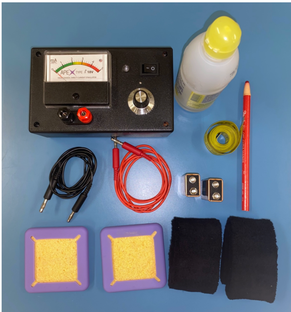
Figure 2. Transcranial direct current stimulation device.

A direct current will be applied by a pair of spongelike surface electrodes soaked in saline (35 cm 2 ) and supplied by a specially developed constant current stimulator with a maximum output of 10 mA. To stimulate the DLPFC, the anode electrode will be placed over F3 according to the international 10-20 system for EEG electrode placement. The cathode will be placed over the contralateral supraorbital area (Figure 2).