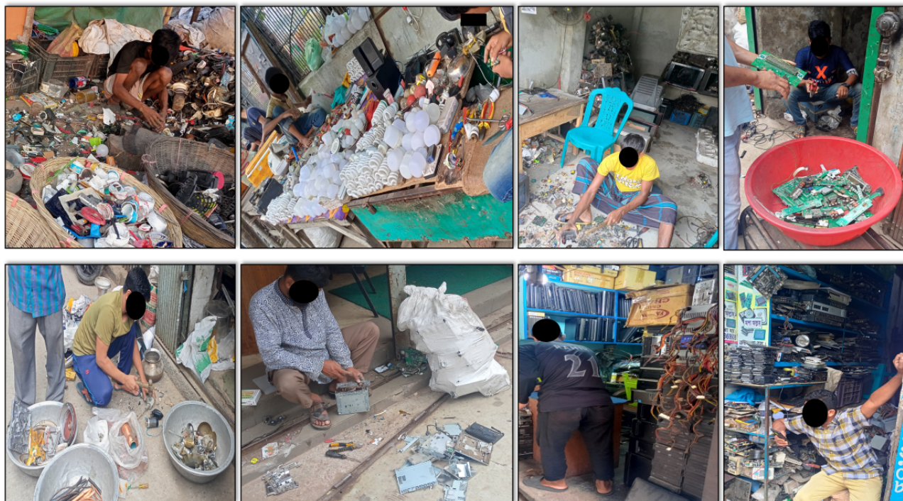
Figure 3. e-Waste exposure sites and working condition.

The trained fieldworkers travelled to the eligible areas and asked the leaders or owners for permission to conduct research within their community. The research team briefly explained the study objectives, procedures, and possible measurements that we were interested in. After providing time for discussion among the workers and owners and obtaining verbal interest to participate, a field team member recorded the GPS coordinates at the location of e-waste sites and developed a line list of workers involved in e-waste processing. Later, the field team sought informed consent from the eligible workers during enrollment. The GPS coordinates were compiled and analyzed using QGIS mapping software (version 3.16.1; Open Source Geospatial Foundation).