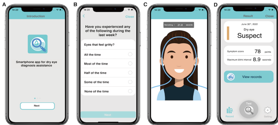
Figure 1. Screenshots of DEA01: screenshots of the (A) welcome screen, (B) Ocular Surface Disease Index (OSDI) questionnaire, (C) measurement of the maximum blink interval, and (D) examination result screen for dry eye diagnostic assistance.

The DEA01 collects dry eye symptoms using the OSDI and MBI to facilitate a DED diagnosis [32]. Blinking is measured using the smartphone camera and the CIFaceFeature function in the iOS interface for facial detection. DEA01 version 1.0 will be installed on an iPhone 13 Pro (Apple Inc). The app will be modified should minor issues arise during the study. Screenshots of the current version of the DEA01 (December 2022) are shown Figure 1 .