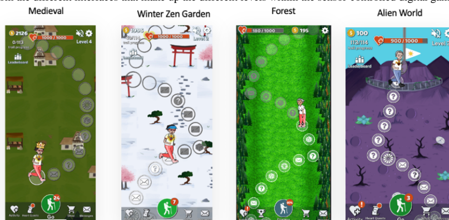
Figure 1. Screenshots from the different interfaces that make up the different levels within the sensor-controlled digital game.

The SCDG, which will be used by the IG in this study, is a smartphone app called Heart Health Mountain, which is available on both iOS and Android platforms. The design of the game was guided by behavioral change mechanisms using the concepts of motivation, ability, and trigger from the Fogg behavioral model and self-determination theoretical frameworks, as described in detail in a previous study [33]. This app has already been developed by a multidisciplinary team and tested through initial usability and feasibility studies and is described in detail elsewhere [28,29]. Several screenshots from the SCDG are pictured in Figure 1.