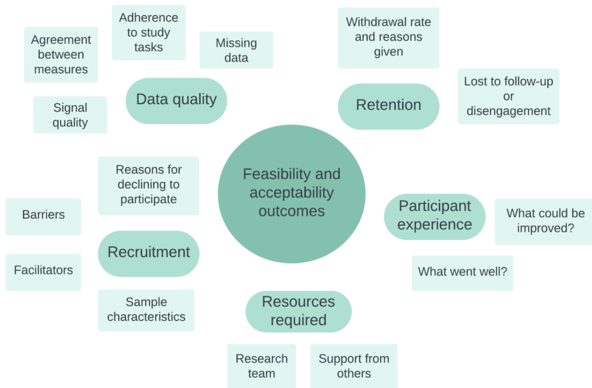
Figure 1. Conceptual map of feasibility and acceptability outcomes for the remote evaluation of sleep to enhance understanding of early dementia study. The core outcomes will be recruitment and retention, data quality, resources required, and participant experience.