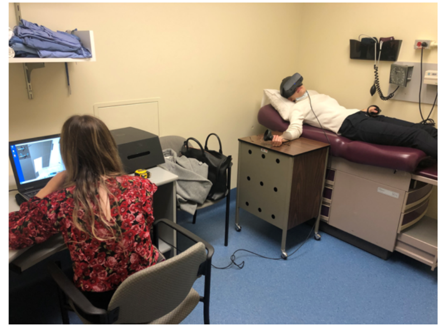
Figure 3. Virtual reality administration and setup.