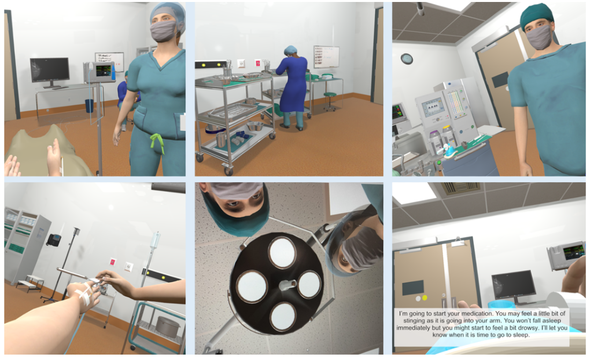
Figure 2. Screenshots of the immersive virtual reality operating room environment.

https://www.researchprotocols.org/2024/1/e55692